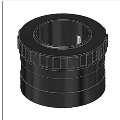
Figure 1. The Precision Centering Adapter.

Constructed entirely from aluminum, the precision centering adapter is extremely lightweight (90 gr). It fits any 2" focusers and it is threaded to accept 2" filters as well.